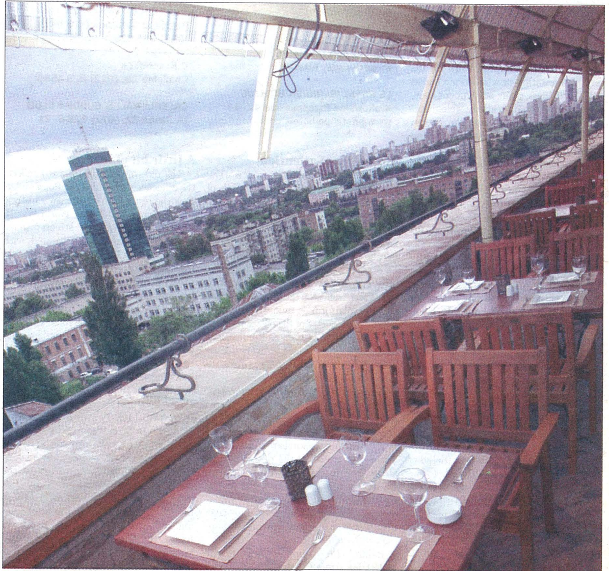
The summer terrace of Panorama provides fresh air, a fabulous view and a tasty fusion European menu – what more is needed for a friendly or even romantic dinner on the roof?

Not being familiar with the specialties of the house, I could have and often do opt for the shashlik, which you can get almost anywhere. This being a review however, I couldn't wimp out, I had to push my culinary comfort zone. With a recommendation from my trusted waitress, who couldn't